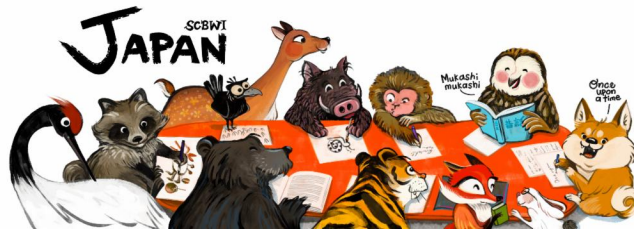
Illustration by Dionnie Takahashi