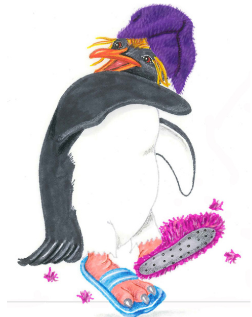
illustration by Lisa Trout

To query Bibi, please send the first 50 pages and a synopsis pasted into the body of an email to agent@ethanellenberg.com . Address the query to Bibi and include "SCBWI Nebraska" in the subject line. The window to query Bibi will remain open indefinitely.