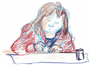
Illustration by Naomi Kojima

Illustration and writing prompt – as we move toward 2025, we will be winding our way into the Year of the Snake. Try your creative hand at an illustration and/or a short piece of writing on the topic of snakes and share it with attendees.