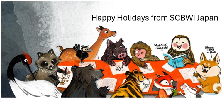
Illustration by Dionnie Takahashi